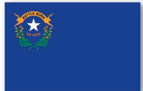
Nevada State Flag