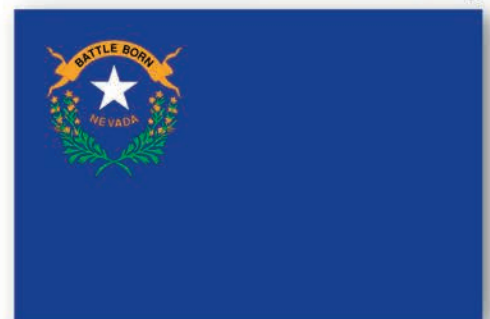
Nevada State Flag